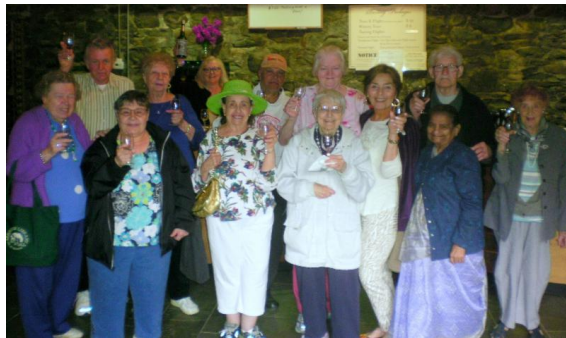
North Rockland Senior Center Members at the Brotherhood Winery

Last month Meals on Wheels' North Rockland Senior Center members enjoyed a trip to the Brotherhood Winery in Washingtonville, NY. Get in on the fun and consider joining one of our five terrific senior centers located in the County. Please click here for more information.