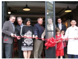
UNoodles Grand Opening

The UNoodles Snack Bar in Haverstraw generously donated $650 to Meals on Wheels. This donation came from proceeds of the restaurant's recent Grand Opening.